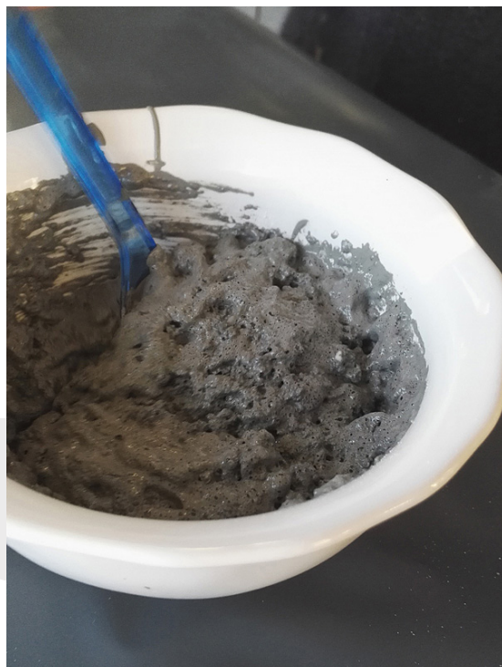
Mixture starts fizzling